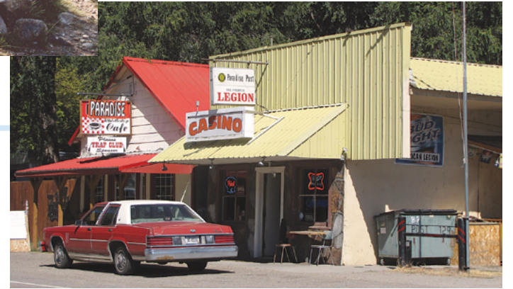
MT OFFICE OF TOURISM

SPIRIT OF MONTANA LABEL In the 20th century the Old West began to morph into the New West. More rural Montanans left the farms and moved to towns. The interstate highways laced the state, reducing the need for trains and stimulating tourism. Small businesses like this one play a big part in independent Montanans' lives.