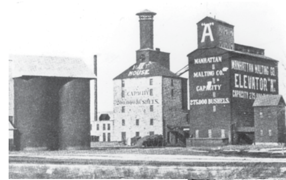
PIONEER MUSEUM-BOZEMAN, MT

THE GOING-TO-THE-SUN ROAD Opened in 1933, this marvel of engineering traverses 56 miles across Glacier National Park and climbs the 6,400-foot Logan Pass to connect the east and west sides of the park. In this 1928 photo the men are removing snow from a deep gulch to begin construction of two retaining walls.