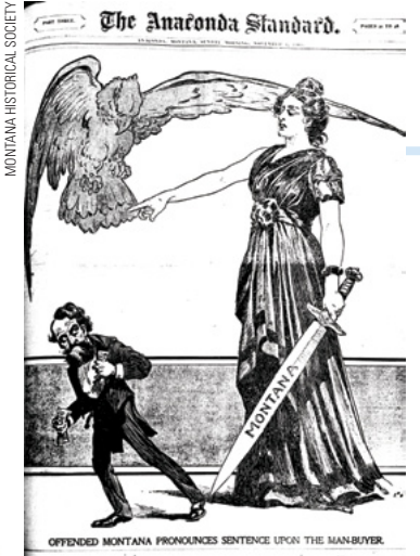
MONTANA HISTORICAL SOCIETY

MINE INTERIOR This photograph represents the numerous copper (and later silver) mines and the enormous amounts of lumber required in building the frames. Notice the thick beams. The lumber industry developed along with mining.